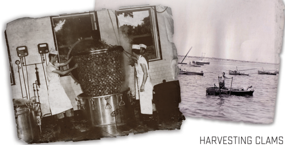
STEAMING CLAMS FOR SHUCKING WARREN, RI - CIRCA 1957