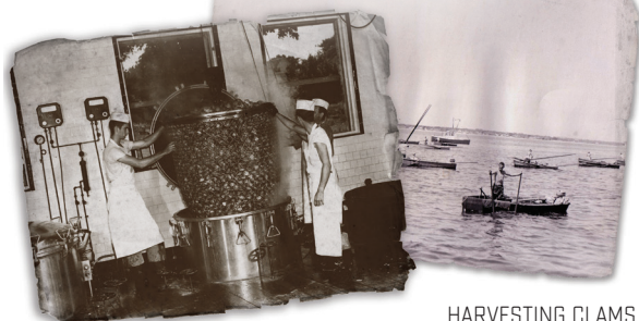
STEAMING CLAMS FOR SHUCKING WARREN, RI - CIRCA 1957