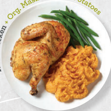
Half Chicken + Org. Mashed Sweet Potatoes