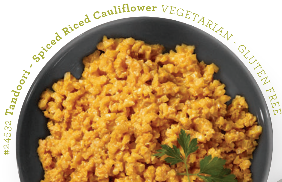
#24532 Tandoori - Spiced Riced Cauliflower VEGETARIAN - GLUTEN FREE

Offer lower carb side dishes like our top-selling Riced Cauliflower & Tandoori-Spiced Riced Cauliflower . Bursting with robust flavors and spices, these plant-based dishes are no sacrifice.