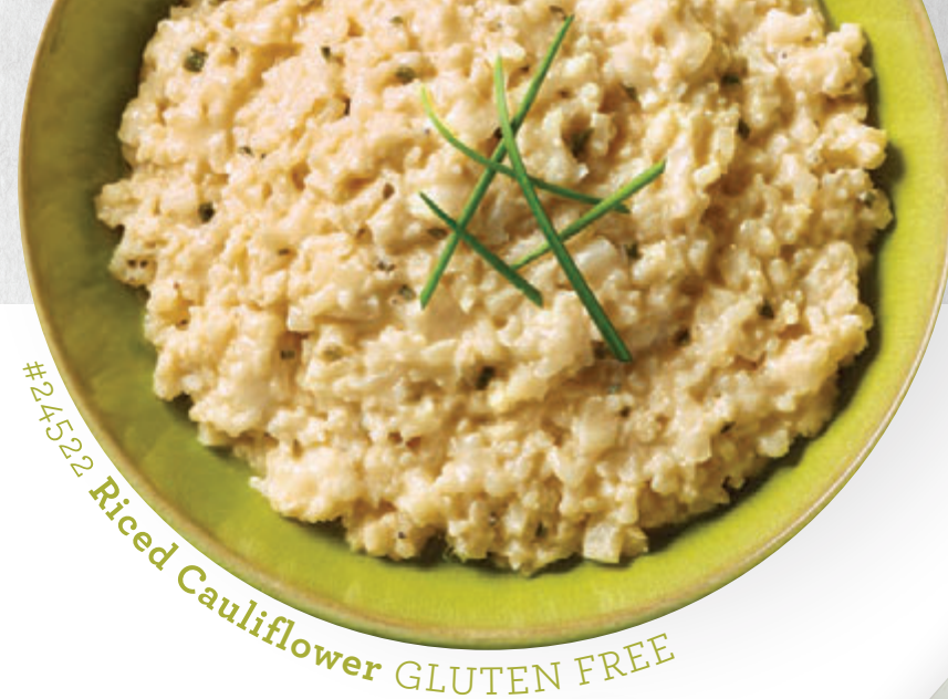
#24522 Riced Cauliflower GLUTEN FREE

of consumers are more willing to buy items described as “plant-based”*