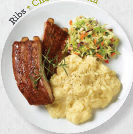
Ribs + Cheesy Polenta