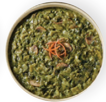
#24505 Creamed Spinach & Kale V - GF