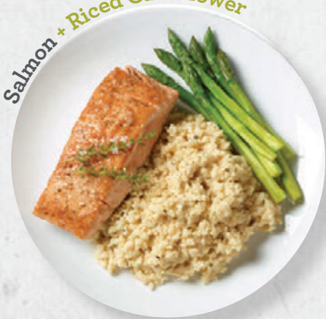
Salmon + Riced Cauliflower