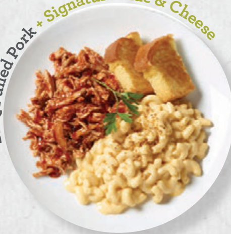
BBQ Pulled Pork + Signature Mac & Cheese