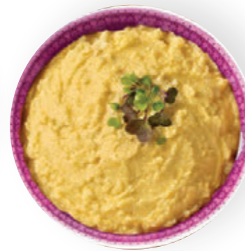
#24518 Cheesy Polenta GF