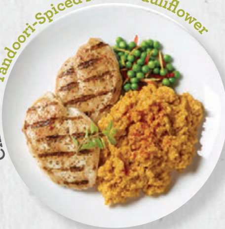
Chicken + Tandoori-Spiced Riced Cauliflower