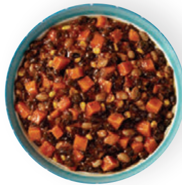
#24531 Black Beans & Sweet Potatoes V* - GF - LF

The protein isn't always the star of meal time when you have such strong supporting roles. Our innovative sides are challenging tradition and bringing meals to the next level. Today's health-conscious and adventure-seeking consumers understand that a balanced meal is where it's at.