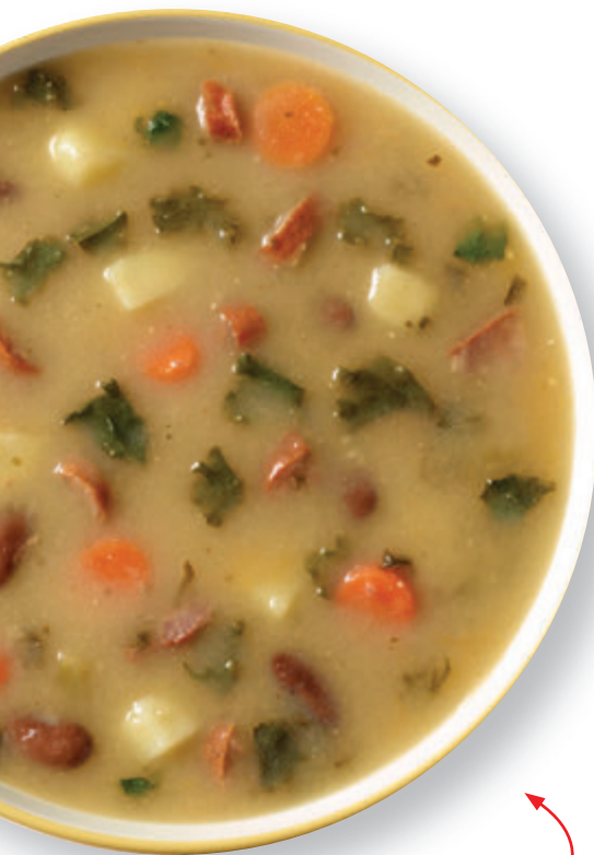
KALE SOUP W/ CHOURICO

BLOUNT CAN HELP YOU KICK IT UP A NOTCH, WITHOUT ANY HASSLE!